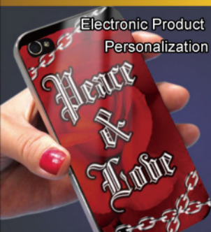
Electronic Product Personalization

The Most Economical UV Printer/Cutter in the World!