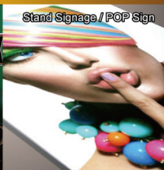
Stand Signage / POP Sign