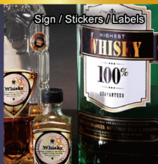
Sign / Stickers / Labels