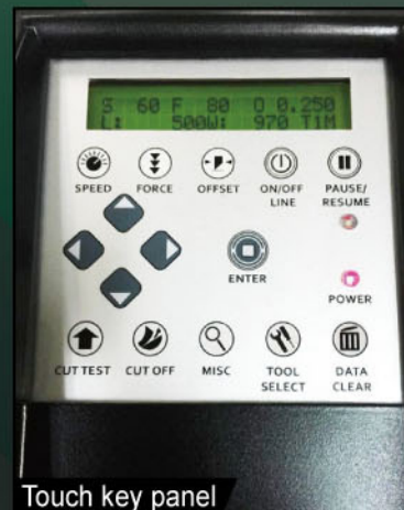
Touch key panel

RXII detect the unique registration marks to distinguish material feeding direction and rotate cutting content automatically.