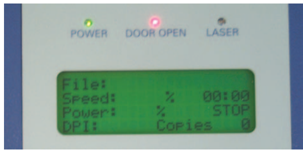
Figure 4: The red light on the control panel alerts the user if the door is open.

lack of power, only moderately limited the material types able to be used on the Venus. Consider, for example, that I was testing the range of materials and not overly concerned with the length of run times to achieve results. Any system with a higher-wattage laser will greatly out-produce a low-wattage system for applications requiring considerable power.