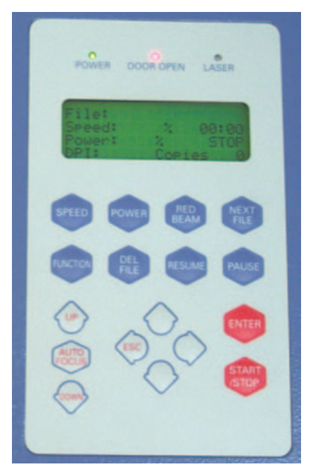
Figure 3: The control panel is very user friendly.

The Venus also fits the bill for a start-up company with a small budget, offering an affordable entry-level