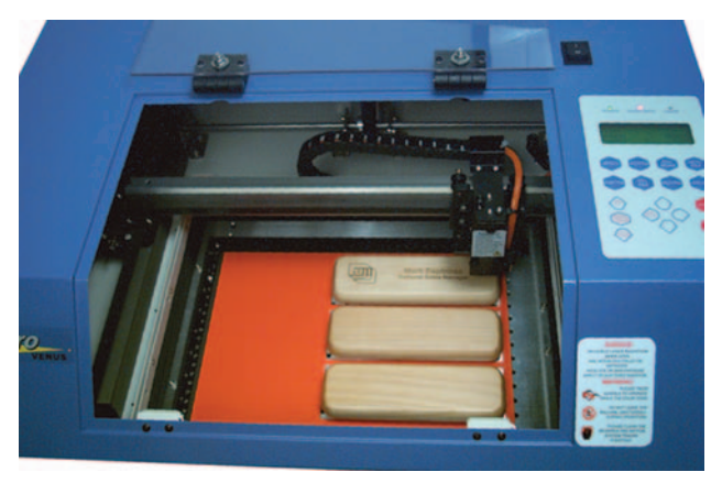
Figure 1: A fixture holds three pen boxes for engraving.

excites the plasma mixture to create the laser energy output.